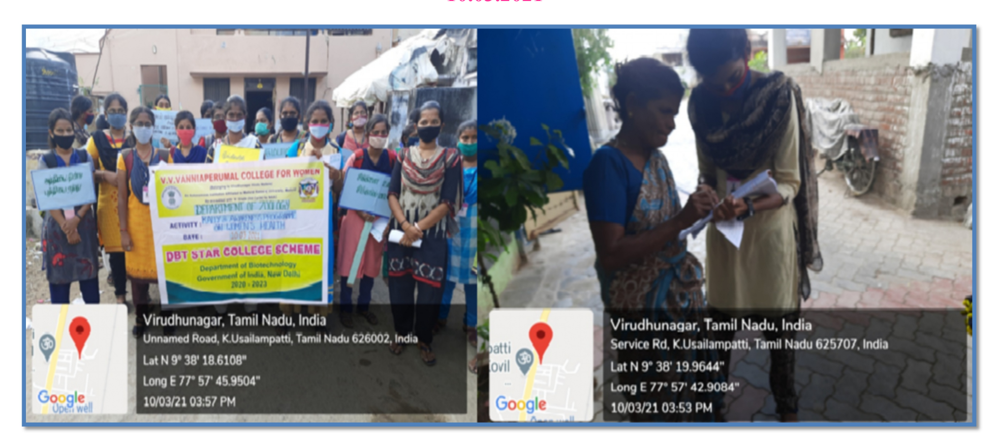
Rally on "Women's Health Awareness Programme"